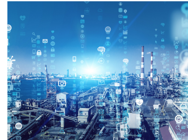
Security & access control