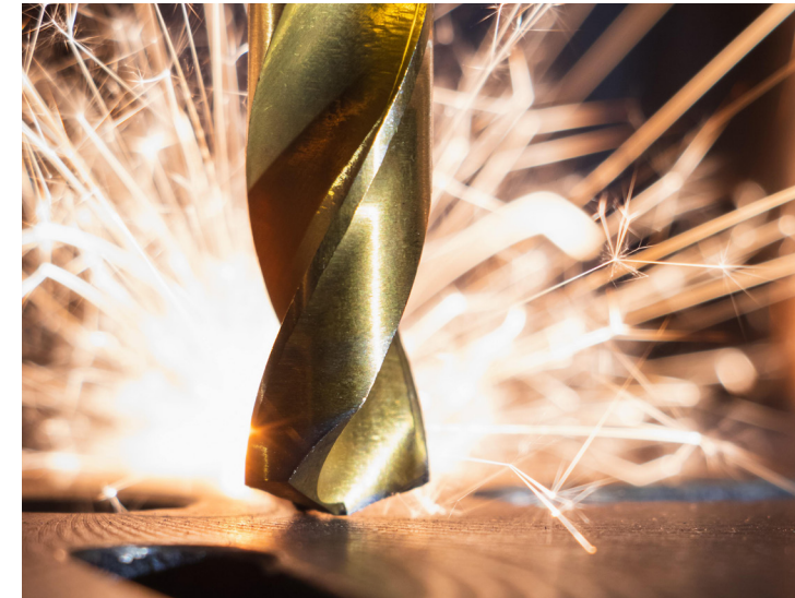
Building materials and tools