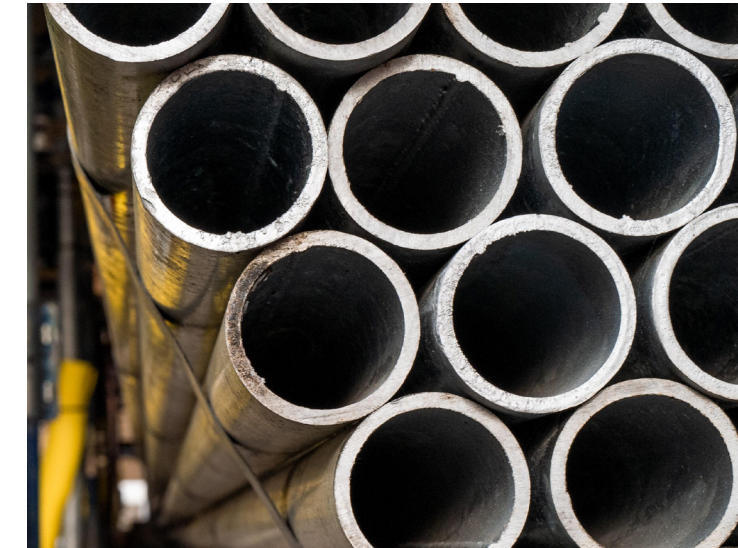
Mechanical, electrical & plumbing services (MEP)