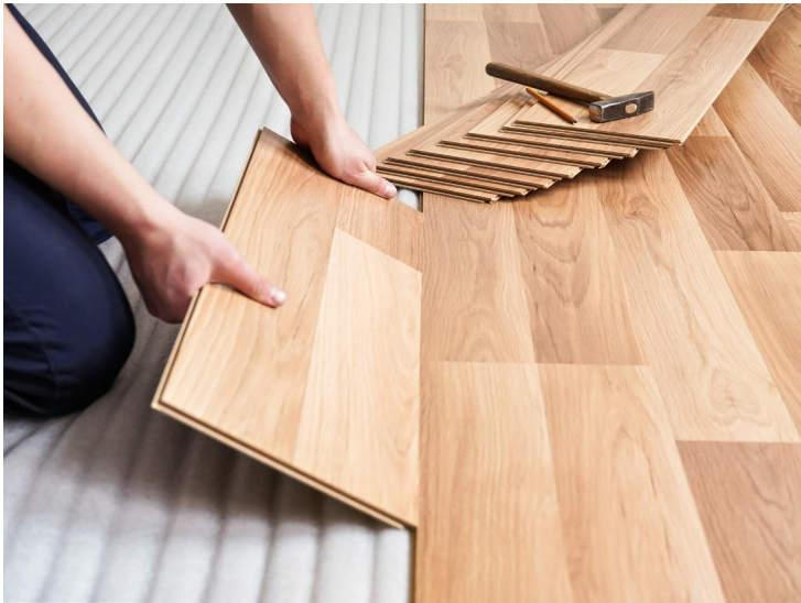
Building interiors & finishes

Dedicated sectors enabling visitors to easily find and source the right solutions for their projects.