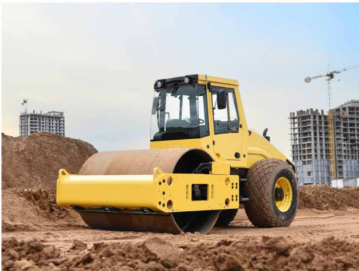
Plant, machinery, and vehicles